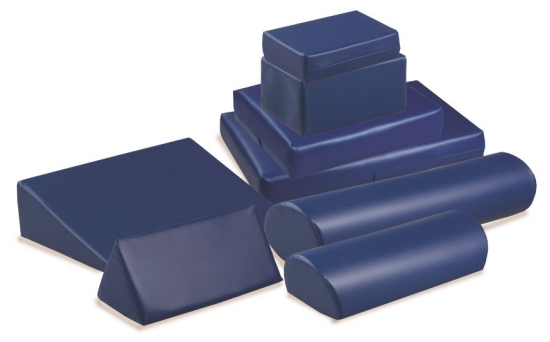
NEW # YSU4